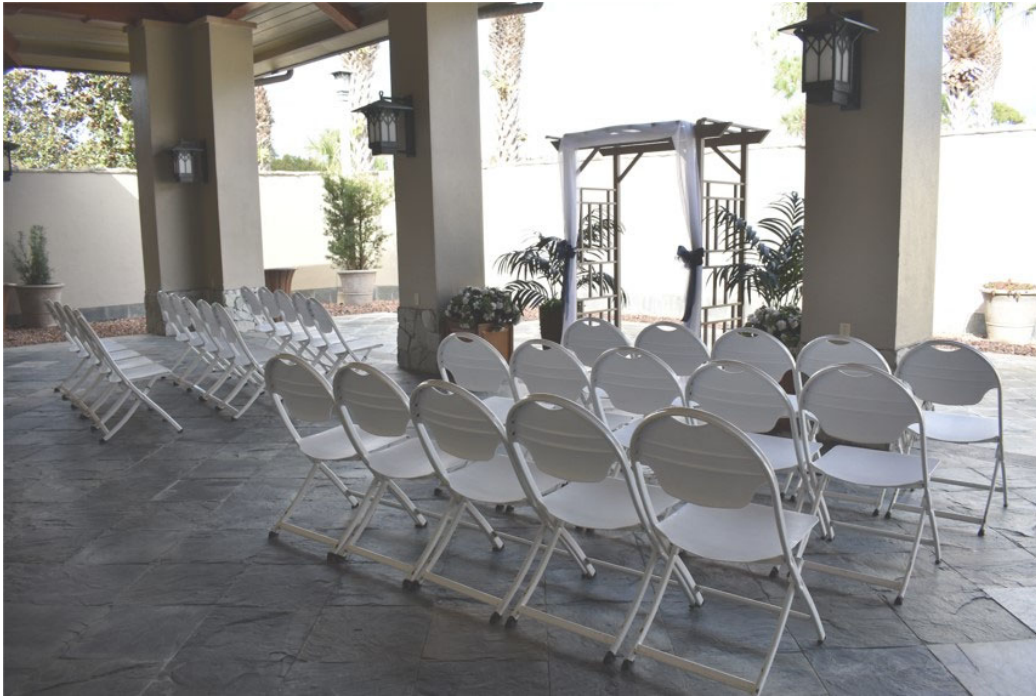
MAGNOLIA PATIO Capacity - 80 guests

Our Palm Package applies to all ceremony + reception weddings. Choose between two beautiful ceremony locations.