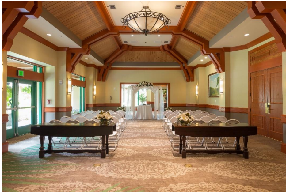
PALM PRE-FUNCTION Capacity - 150 guests

***Prices Subject to Change Without Notice***