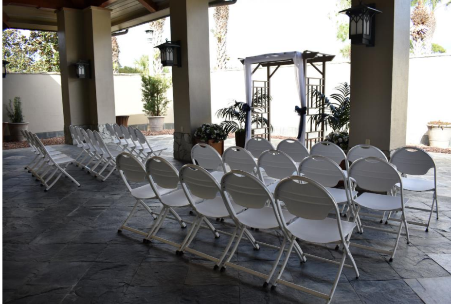
MAGNOLIA PATIO Capacity - 80 guests

Our Palm Package applies to all ceremony + reception weddings. Choose between two beautiful ceremony locations.