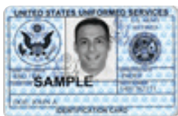
DD Form 2 (Retired)