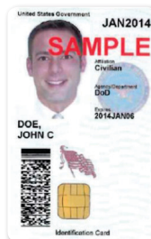
Common Access Card