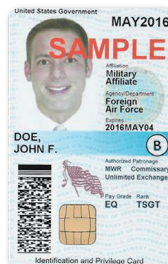
Common Access Card

Active Military Foreign Affiliate Eligible only with this ID (no other ID accepted)