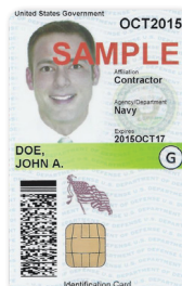
Common Access Card

Active Military Foreign Affiliate Eligible only with this ID (no other ID accepted)