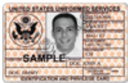
DD Form 1173

Retired Reserves Retired National Guard Eligible